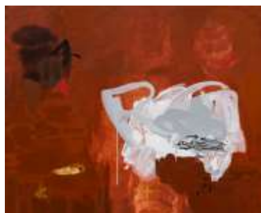
Yeh Chu-Sheng · ransform 3 · 2020 Acrylic and oil on canvas 130 x 162 cm