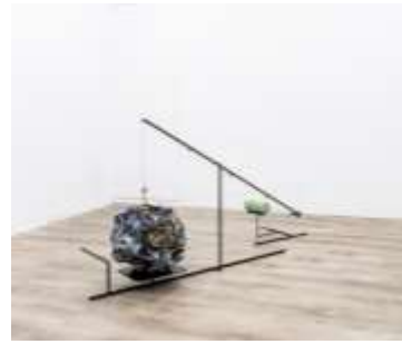
Hsu Jui-Chien · Irregular Circle -3 · 2021 Iron, stainless steel, crayon, glass, rope 87 x 184 x 80 cm