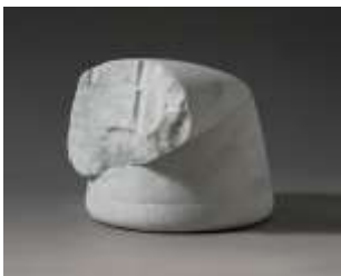
Wu Meng-Chang · Meditate · 2020 White Marble 31 x 39 x 36 cm