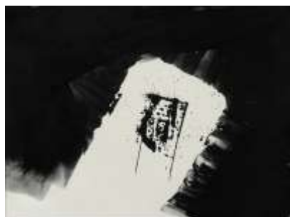
Wu Ying-Hai · The empty body of dreams 002 · 2021 Composite pigment on canvas 50 x 68 cm