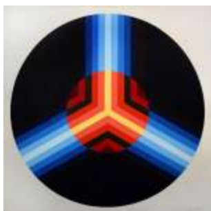
Lee Shi-Chi · Untitled-1 · 1967 Mixed Media 130 x 130 cm

Lineage 2023 serves as an index to a cross-dimensional map. Through the diverse approaches to artistic creation employed by the nine artists showcased in this exhibition, the exhibition embarks on an exploration to unveil the similar and meticulous rational thinking that connects the individualistic aura of the artists behinds their seemingly dissimilar works. The exhibition therefore aims to open up a gateway for the audience to discover new clues in this inter-generational and cross-dimensional dialogue.