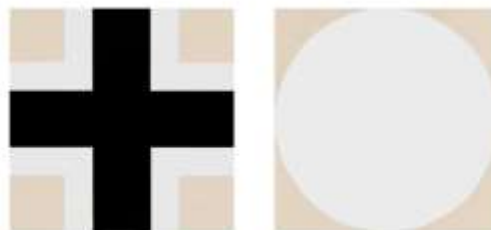
Chen Shiau-Peng · Under the Surface: The Orientation and the Reposition · 2018 Acrylic on canvas 112 x 112 cm each, set of 2