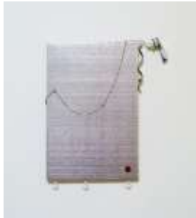
Kung Pao-Leng · Luminous point · 2020 Aluminum foil mat, ball chain, stainless steel, toilet trip lever, sanding disc, screw hooks, wooden panel 3 x 50 x 40 cm